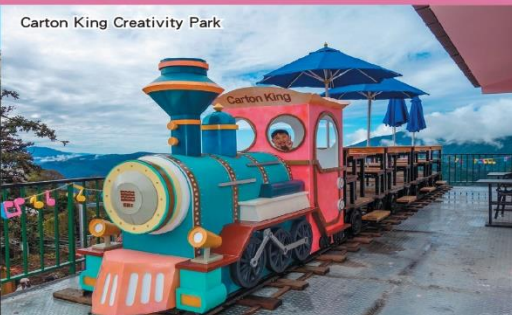
Carton King Creativity Park